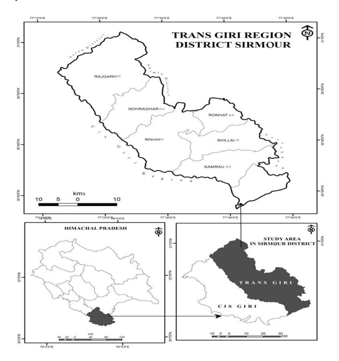
Fig 1: Location Map of the Study Area